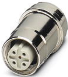
Sensor/actuator flush-type socket, 5-pos., M12, B-coded, front/press-in mounting, with straight solder connection

Please be informed that the data shown in this PDF Document is generated from our Online Catalog. Please find the complete data in the user's documentation. Our General Terms of Use for Downloads are valid ( http://download.phoenixcontact.com )