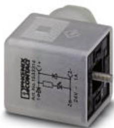
Valve connectors, 3-position, Valve connector A, with 1 LED, connected with Damping diode, Screw connection, cable gland Pg9, external cable diameter 6 mm ... 8 mm

Please be informed that the data shown in this PDF Document is generated from our Online Catalog. Please find the complete data in the user's documentation. Our General Terms of Use for Downloads are valid ( http://phoenixcontact.com/download )