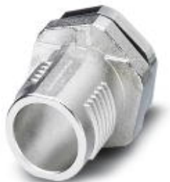
M12 SPEEDCON housing screw connection for M12 male inserts, with O-ring, for all SPEEDCON-capable THR and wave soldering contact carriers

Please be informed that the data shown in this PDF Document is generated from our Online Catalog. Please find the complete data in the user's documentation. Our General Terms of Use for Downloads are valid ( http://phoenixcontact.com/download )