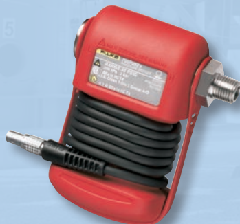
Fluke 700PEX Pressure Modules