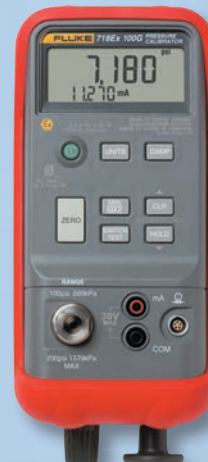
Fluke 718Ex Pressure Calibrator