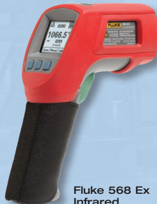
Fluke 568 Ex Infrared Thermometer