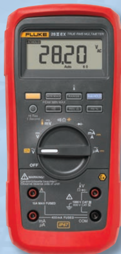
Fluke 28II Ex True-rms Industrial Multimeter