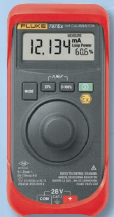
Fluke 707Ex Loop Calibrator