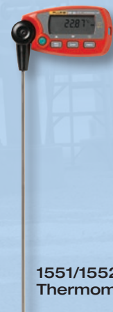
1551/1552 "Stik" Thermometers