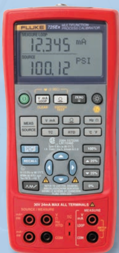
Fluke 725Ex Multifunction Process Calibrator

Fluke offers the widest range of reliable, accurate and intrinsically safe test tools. Including true-rms multimeters, infrared thermometers, process calibrators, pressure calibrators, loop calibrators and precision pressure test gauges.