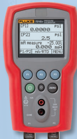
Fluke 721Ex Precision Pressure Calibrator