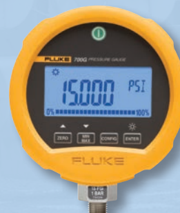
700G Series Precision Pressure Test Gauges