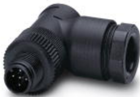
Sensor/actuator connector, male, angled, 5-pos., M12, A-coded, screw connection, plastic knurl, cable screw connection Pg11-DUO

Please be informed that the data shown in this PDF Document is generated from our Online Catalog. Please find the complete data in the user's documentation. Our General Terms of Use for Downloads are valid ( http://download.phoenixcontact.com )