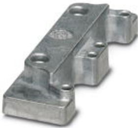
HEAVYCON-ADVANCE mounting flange for screw locking HC B 32/48

Please be informed that the data shown in this PDF Document is generated from our Online Catalog. Please find the complete data in the user's documentation. Our General Terms of Use for Downloads are valid ( http://download.phoenixcontact.com )