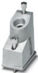
Aluminum die-cast sleeve housing, with grommet, locking screws with knurled head, for a metric M20 cable gland, angled cable outlet, type VC1

Please be informed that the data shown in this PDF Document is generated from our Online Catalog. Please find the complete data in the user's documentation. Our General Terms of Use for Downloads are valid ( http://download.phoenixcontact.com )