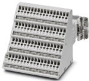
HEAVYCON terminal adapter female insert, D64 series, 64-pos., left protective conductor connection for the right side of the control cabinet, screw connection

Please be informed that the data shown in this PDF Document is generated from our Online Catalog. Please find the complete data in the user's documentation. Our General Terms of Use for Downloads are valid ( http://download.phoenixcontact.com )