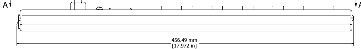
ASSEMBLY - VIEW FROM SIDE