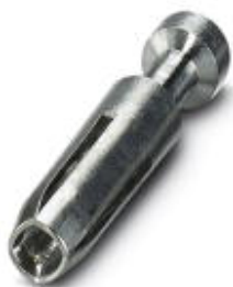
Turned 2.5 crimp contact, individual CuNi female contact, core cross section 0.5 mm 2 , uncoated

Please be informed that the data shown in this PDF Document is generated from our Online Catalog. Please find the complete data in the user's documentation. Our General Terms of Use for Downloads are valid ( http://phoenixcontact.com/download )