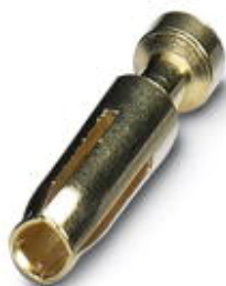
Turned 2.5 crimp contact, individual Fe female contact, core cross section 0.5 mm 2 , Au surface

Please be informed that the data shown in this PDF Document is generated from our Online Catalog. Please find the complete data in the user's documentation. Our General Terms of Use for Downloads are valid ( http://phoenixcontact.com/download )