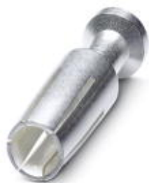
Turned 4.0 crimp contact, single socket contact, 10 mm 2 conductor cross section, silver-plated

Please be informed that the data shown in this PDF Document is generated from our Online Catalog. Please find the complete data in the user's documentation. Our General Terms of Use for Downloads are valid ( http://phoenixcontact.com/download )