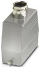
HEAVYCON sleeve housing B10, for single locking latch, height 72 mm, with screw connection 1x M25, straight conductor exit

Please be informed that the data shown in this PDF Document is generated from our Online Catalog. Please find the complete data in the user's documentation. Our General Terms of Use for Downloads are valid ( http://download.phoenixcontact.com )