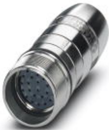
Coupler connector, straight, Screw locking, M27, Number of positions: 26, Type of contact: Socket, Solder connection, shielded: yes, Cable diameter: 2 mm...14.5 mm

Please be informed that the data shown in this PDF Document is generated from our Online Catalog. Please find the complete data in the user's documentation. Our General Terms of Use for Downloads are valid ( http://phoenixcontact.com/download )