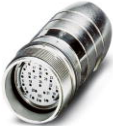
Coupler connector, straight, Screw locking, M27, Number of positions: 26, Type of contact: Socket, Crimp connection, shielded: Yes, Cable diameter: 2 mm...14.5 mm

Please be informed that the data shown in this PDF Document is generated from our Online Catalog. Please find the complete data in the user's documentation. Our General Terms of Use for Downloads are valid ( http://phoenixcontact.com/download )