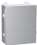
1414 NEMA 4X Stainless Steel Enclosure