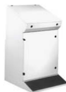
Series 2000 Console