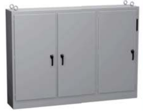
UHD Heavy Duty Disconnect Enclosures