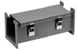
1485 Wiring Trough