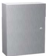
Eclipse Stainless Steel Enclosure