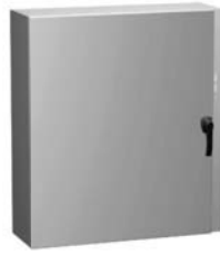
EN4DSC Single Door Disconnect Enclosure