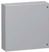
Eclipse Single Door Enclosure