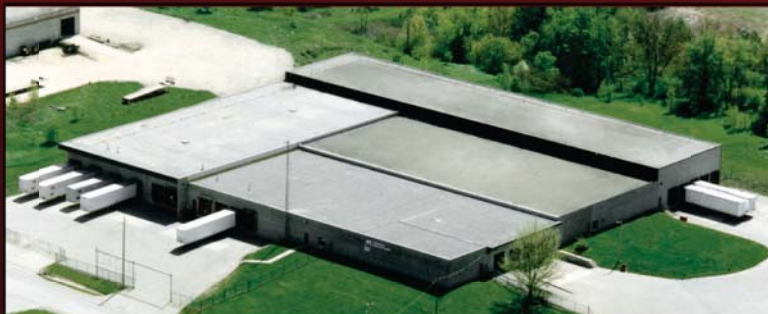
Hammond Distribution Center

We've committed our people and resources to ensuring you get exactly what you need, when you need it.