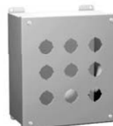
1437 Pushbutton Enclosure