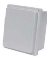
PJ Raised Lid Polyester Enclosure