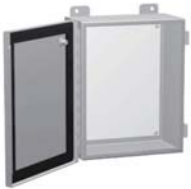
1414 NEMA 4 PH Enclosure