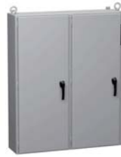
2UD Double Door Disconnect Enclosures