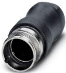
Sleeve housing for coupler connector, straight plastic-sheathed, Screw locking, M23, Shielded: Yes, Cable cross section: 2 mm...10.5 mm

Please be informed that the data shown in this PDF Document is generated from our Online Catalog. Please find the complete data in the user's documentation. Our General Terms of Use for Downloads are valid ( http://download.phoenixcontact.com )