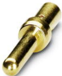
Crimp contact, turned, Single contact, contact diameter: 1 mm, crimp range: 0.14 mm 2 ... 0.56 mm 2

Please be informed that the data shown in this PDF Document is generated from our Online Catalog. Please find the complete data in the user's documentation. Our General Terms of Use for Downloads are valid ( http://phoenixcontact.com/download )