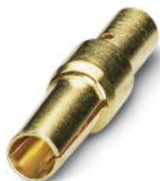
Crimp contact, turned, Single contact, contact diameter: 1 mm, crimp range: 0.14 mm 2 ... 0.56 mm 2

Please be informed that the data shown in this PDF Document is generated from our Online Catalog. Please find the complete data in the user's documentation. Our General Terms of Use for Downloads are valid ( http://phoenixcontact.com/download )