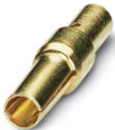
Crimp contact, turned, contact diameter: 2 mm, crimp range: 1.5 mm 2 ... 2.5 mm 2

Please be informed that the data shown in this PDF Document is generated from our Online Catalog. Please find the complete data in the user's documentation. Our General Terms of Use for Downloads are valid ( http://phoenixcontact.com/download )