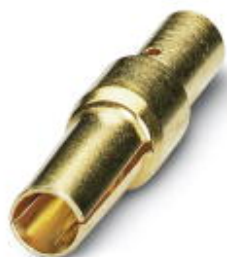
Crimp contact, turned, contact diameter: 2 mm, crimp range: 1 mm 2 ... 1.5 mm 2

Please be informed that the data shown in this PDF Document is generated from our Online Catalog. Please find the complete data in the user's documentation. Our General Terms of Use for Downloads are valid ( http://phoenixcontact.com/download )