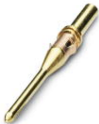
Crimp contact, turned, Contact diameter: 1 mm, Crimp range: 0.14 mm 2 ...0.75 mm 2

Please be informed that the data shown in this PDF Document is generated from our Online Catalog. Please find the complete data in the user's documentation. Our General Terms of Use for Downloads are valid ( http://phoenixcontact.com/download )