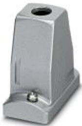
HEAVYCON ADVANCE standard powder-coated sleeve housing B6, with screw locking, height 100 mm, with 1xM25 thread, straight cable outlet

Please be informed that the data shown in this PDF Document is generated from our Online Catalog. Please find the complete data in the user's documentation. Our General Terms of Use for Downloads are valid ( http://download.phoenixcontact.com )