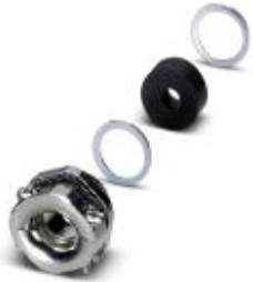
Cable gland, shielded: No, Cable diameter: 7 mm...10 mm

Please be informed that the data shown in this PDF Document is generated from our Online Catalog. Please find the complete data in the user's documentation. Our General Terms of Use for Downloads are valid ( http://phoenixcontact.com/download )