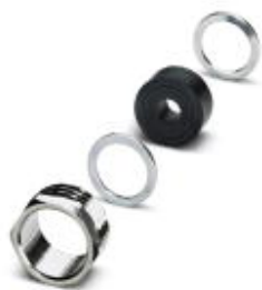
Cable gland, shielded: no, cable diameter range: 6 mm ... 10 mm

Please be informed that the data shown in this PDF Document is generated from our Online Catalog. Please find the complete data in the user's documentation. Our General Terms of Use for Downloads are valid ( http://phoenixcontact.com/download )