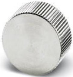
Metal dust protection cap for signal connectors with M23 external thread

Please be informed that the data shown in this PDF Document is generated from our Online Catalog. Please find the complete data in the user's documentation. Our General Terms of Use for Downloads are valid ( http://phoenixcontact.com/download )