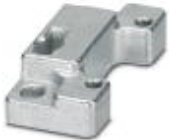
Panel mounting flange for HEAVYCON ADVANCE TMB housing with bayonet locking