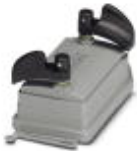
HEAVYCON ADVANCE IP65 protective cover B10, with bayonet locking, with retaining cord, diameter of retaining cord eyelet 3 mm

Protective covers - HC-B 10-TMB-SD-IP65 - 1690943