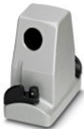
HEAVYCON ADVANCE EMV sleeve housing B10, with bayonet locking, height 100 mm, with 1xM25 thread, lateral cable outlet

Please be informed that the data shown in this PDF Document is generated from our Online Catalog. Please find the complete data in the user's documentation. Our General Terms of Use for Downloads are valid ( http://download.phoenixcontact.com )