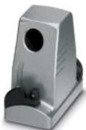
HEAVYCON ADVANCE standard powder-coated, sleeve housing B10, with bayonet locking, height 100 mm, with 1xM25 thread, lateral cable outlet

Please be informed that the data shown in this PDF Document is generated from our Online Catalog. Please find the complete data in the user's documentation. Our General Terms of Use for Downloads are valid ( http://phoenixcontact.com/download )