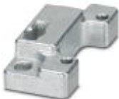
Panel mounting flange for HEAVYCON ADVANCE TMB housing with bayonet locking