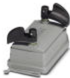
HEAVYCON ADVANCE IP65 protective cover B10, with bayonet locking, with retaining cord, diameter of retaining cord eyelet 3 mm

Protective covers - HC-B 10-TMB-SD-IP65 - 1690943