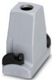
HEAVYCON ADVANCE EMV sleeve housing B10, with bayonet locking, height 100 mm, with 1x M32 thread, straight cable outlet

Please be informed that the data shown in this PDF Document is generated from our Online Catalog. Please find the complete data in the user's documentation. Our General Terms of Use for Downloads are valid ( http://download.phoenixcontact.com )