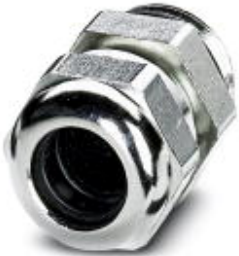
Cable gland, shielded: No, Cable diameter: 9 mm...13 mm

Please be informed that the data shown in this PDF Document is generated from our Online Catalog. Please find the complete data in the user's documentation. Our General Terms of Use for Downloads are valid ( http://phoenixcontact.com/download )