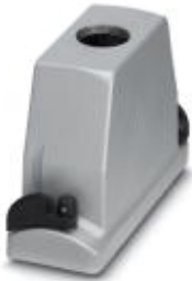
HEAVYCON ADVANCE EMV sleeve housing B16, with bayonet locking, height 100 mm, with 1x M40 thread, straight cable outlet

Please be informed that the data shown in this PDF Document is generated from our Online Catalog. Please find the complete data in the user's documentation. Our General Terms of Use for Downloads are valid ( http://download.phoenixcontact.com )