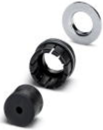
Cable clamp type cage and shield adapter, shielded: yes, cable diameter range: 2 mm ... 10.5 mm

Please be informed that the data shown in this PDF Document is generated from our Online Catalog. Please find the complete data in the user's documentation. Our General Terms of Use for Downloads are valid ( http://phoenixcontact.com/download )