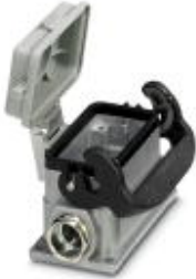
HEAVYCON box mounting base B10, with double locking latch, height 52 mm, with supports 2xM20 and protective cover

Please be informed that the data shown in this PDF Document is generated from our Online Catalog. Please find the complete data in the user's documentation. Our General Terms of Use for Downloads are valid ( http://download.phoenixcontact.com )