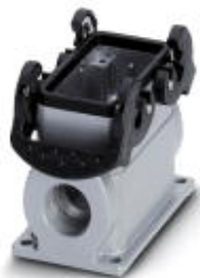
HEAVYCON box mounting base B10, with double locking latch, height 52 mm, with supports 2xM25

Please be informed that the data shown in this PDF Document is generated from our Online Catalog. Please find the complete data in the user's documentation. Our General Terms of Use for Downloads are valid ( http://phoenixcontact.com/download )