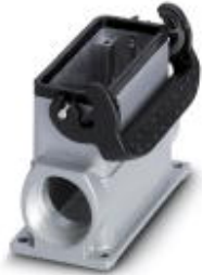
HEAVYCON box mounting base B16, with single locking latch, height 67 mm, with supports 2xM25

Please be informed that the data shown in this PDF Document is generated from our Online Catalog. Please find the complete data in the user's documentation. Our General Terms of Use for Downloads are valid ( http://download.phoenixcontact.com )