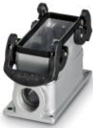
HEAVYCON box mounting base B16, with double locking latch, height 67 mm, with support 1xM32

Please be informed that the data shown in this PDF Document is generated from our Online Catalog. Please find the complete data in the user's documentation. Our General Terms of Use for Downloads are valid ( http://phoenixcontact.com/download )