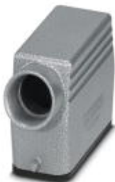
HEAVYCON sleeve housing D15, for single locking latch, height 53 mm, with support 1x M20, lateral conductor exit

Please be informed that the data shown in this PDF Document is generated from our Online Catalog. Please find the complete data in the user's documentation. Our General Terms of Use for Downloads are valid ( http://phoenixcontact.com/download )