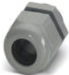
Cable gland, cable gland material: PA, external cable diameter 11 mm ... 17 mm, shielding: no, connecting thread: M25 x 1.5, color: silver-gray RAL 7001

Cable gland - G-INS-M25-M68N-PNES-GY - 1411126