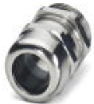
Cable gland, cable gland material: Nickel-plated brass, external cable diameter 11 mm ... 17 mm, shielding: no, connecting thread: M25 x 1.5, color: silver, with O-ring

Cable gland - G-INS-M25-M68N-NNES-S - 1411165