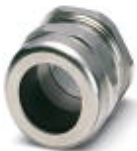
Metal screw connection up to 5 bar, thread length: 7 mm, cable diameter: 14 - 21 mm, WAF 34, screw connection: M25

Cable gland - HC-M-KV-M25(14-21) - 1646007