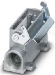
HEAVYCON box mounting base D25, with single locking latch, height 57 mm, with supports 2xM25

Please be informed that the data shown in this PDF Document is generated from our Online Catalog. Please find the complete data in the user's documentation. Our General Terms of Use for Downloads are valid ( http://phoenixcontact.com/download )