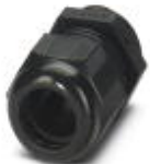
Cable gland, cable gland material: PA, external cable diameter 11 mm ... 17 mm, shielding: no, connecting thread: M25 x 1.5, color: jet black RAL 9005

Cable gland - G-INS-M25-M68N-PNES-BK - 1411134