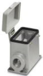
HEAVYCON box mounting base D50 for double locking latch, height 97 mm, with support 1xM25, with cover

Please be informed that the data shown in this PDF Document is generated from our Online Catalog. Please find the complete data in the user's documentation. Our General Terms of Use for Downloads are valid ( http://phoenixcontact.com/download )