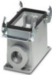
HEAVYCON box mounting base D50, with double locking latch, height 81 mm, with support 2xM32

Please be informed that the data shown in this PDF Document is generated from our Online Catalog. Please find the complete data in the user's documentation. Our General Terms of Use for Downloads are valid ( http://phoenixcontact.com/download )