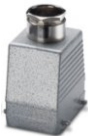
HEAVYCON sleeve housing D50, for double locking latch, height 76 mm, with support 1x M32, straight conductor exit

Please be informed that the data shown in this PDF Document is generated from our Online Catalog. Please find the complete data in the user's documentation. Our General Terms of Use for Downloads are valid ( http://download.phoenixcontact.com )