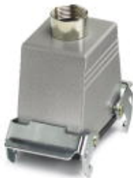
HEAVYCON sleeve housing D50, with double locking latch, height 76 mm, with support 1x M25, straight conductor exit

Please be informed that the data shown in this PDF Document is generated from our Online Catalog. Please find the complete data in the user's documentation. Our General Terms of Use for Downloads are valid ( http://download.phoenixcontact.com )