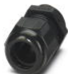
Cable gland, cable gland material: PA, external cable diameter 11 mm ... 17 mm, shielding: No, connecting thread: M25 x 1.5, color: jet black RAL 9005

Cable gland - G-INS-M25-M68N-PNES-BK - 1411134