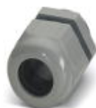
Cable gland, cable gland material: PA, external cable diameter 11 mm ... 17 mm, shielding: No, connecting thread: M25 x 1.5, color: silver-gray RAL 7001

Cable gland - G-INS-M25-M68N-PNES-GY - 1411126