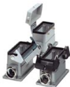
HEAVYCON box mounting base HV6, with double locking latch, height 67 mm, with support 1xM25

Please be informed that the data shown in this PDF Document is generated from our Online Catalog. Please find the complete data in the user's documentation. Our General Terms of Use for Downloads are valid ( http://download.phoenixcontact.com )