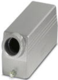
HEAVYCON sleeve housing HV6, for single locking latch, height 60 mm, with support 1x M25, lateral conductor exit

Please be informed that the data shown in this PDF Document is generated from our Online Catalog. Please find the complete data in the user's documentation. Our General Terms of Use for Downloads are valid ( http://download.phoenixcontact.com )