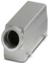
HEAVYCON sleeve housing HV6, for double locking latch, height 45 mm, with support 1x M25, lateral conductor exit

Please be informed that the data shown in this PDF Document is generated from our Online Catalog. Please find the complete data in the user's documentation. Our General Terms of Use for Downloads are valid ( http://download.phoenixcontact.com )