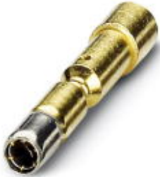
Crimp contact, Wire spring, Single contact, Contact diameter: 1 mm, Crimp range: 0.14 mm 2 ...1 mm 2

Please be informed that the data shown in this PDF Document is generated from our Online Catalog. Please find the complete data in the user's documentation. Our General Terms of Use for Downloads are valid ( http://download.phoenixcontact.com )