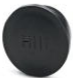
Plastic dust protection cap, anti-static, for RF, SF series connectors, with M23 external thread

Plastic anti-static dust protection cap - RC-Z2469 - 1611797