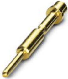
Crimp contact, turned, Single contact, Contact diameter: 1 mm, Crimp range: 0.25 mm 2 ...1 mm 2

Please be informed that the data shown in this PDF Document is generated from our Online Catalog. Please find the complete data in the user's documentation. Our General Terms of Use for Downloads are valid ( http://download.phoenixcontact.com )