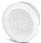
Plastic dust protection cap for connectors with M23 external thread

Plastic dust protection cap - RC-Z2059 - 1604225