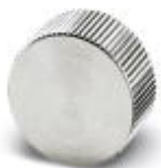
Metal dust protection cap for power plugs with M23 external thread

Metal dust protection cap - SC-Z2319 - 1605456